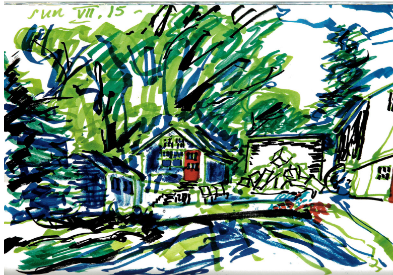
Otto Piene, Studio Overview with Sheep Shed Studio, Fire Studio, and Barn Studio , 2012, markers on paper, 11" x 14", Private Collection