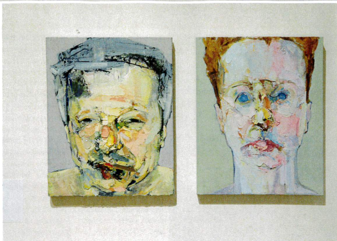
TOP: Installation shot of Lavaughan Jenkins, Soltani , 2016, oil on canvas, 20" x 16" (left); Taylor , 2016, oil on canvas, 20" x 16" (right); photograph ©2017 Charles Sternaimolo.