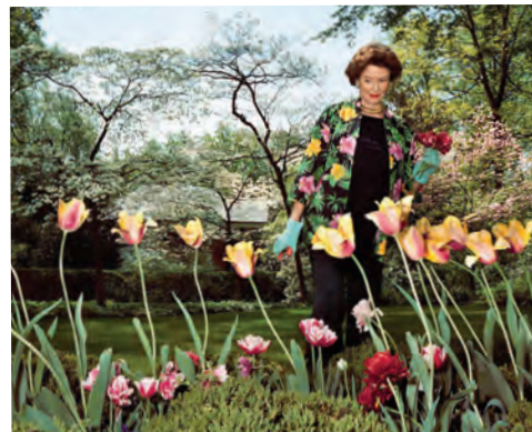
Mum in her garden, Washington, D.C., 2003