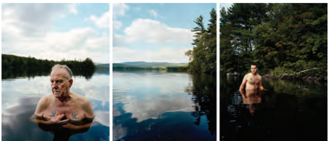
Rock Bottom, 2008