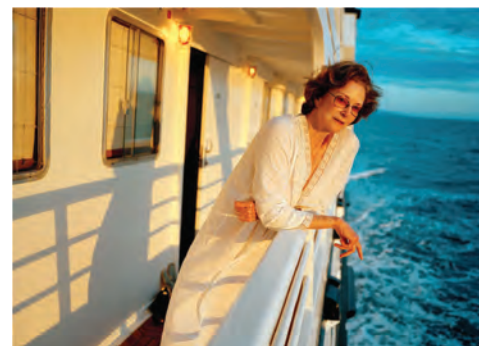
Sunrise dolphin watch on eco-cruise, Baja California, 2007