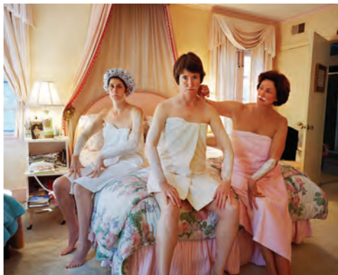
Bleaching ritual, Washington, D.C., 2003