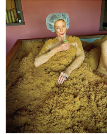
Cedar enzyme bath, Osmosis Spa, Freestone, CA, 2010